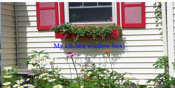
My kitchen window-box!